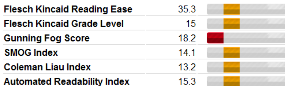
Figure 3. Readability scores of example 6

information. In fact, Figure 3 also to some extent substantiates that argument.