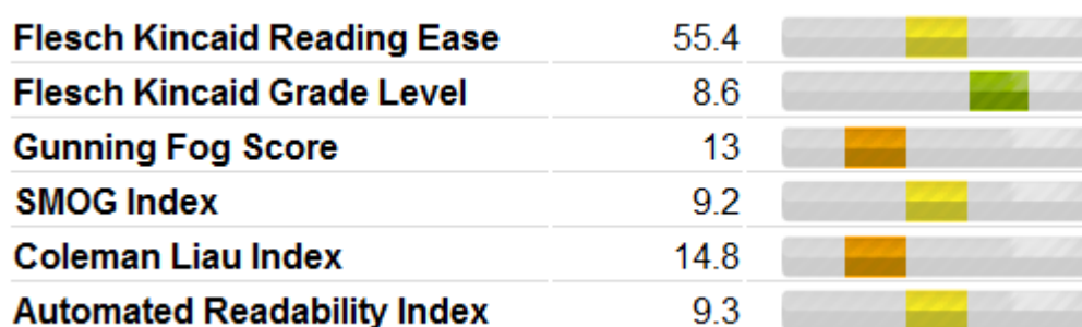
Figure 4: Readability Scores of Example 7

Here "following" is a preposition. However, in this complex and fragment-like example with two colons the reader's personal assumption is a prerequisite for successful text reception. The combination of the preposition "following" with a fragment "100-150 mg daily in divided doses" is not satisfactory from a safety point of view, because it is complex and difficult to understand for patients. The readability scores shown in Figure 4 do not, however, support that argument. One explanation is that this example consists of fragment-like utterances and that the sentences are relatively short.